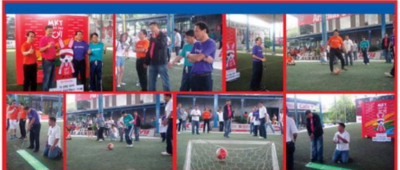
Opening Declaration by 4 CEOs