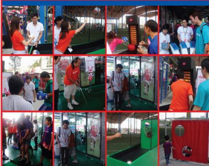
Booth of various games